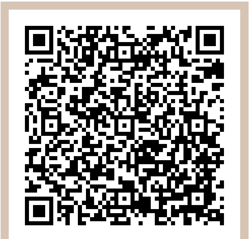
Scan the code above with your mobile device or click it to go directly to the Celebrity Homes & Townhomes website for 14905 S 17 Street, Bellevue, Ne 68123