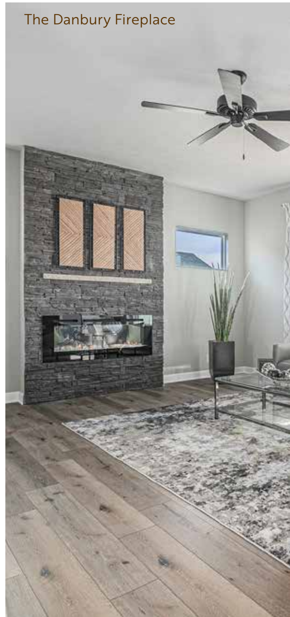
The Danbury Fireplace