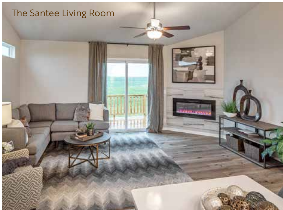
The Santee Living Room