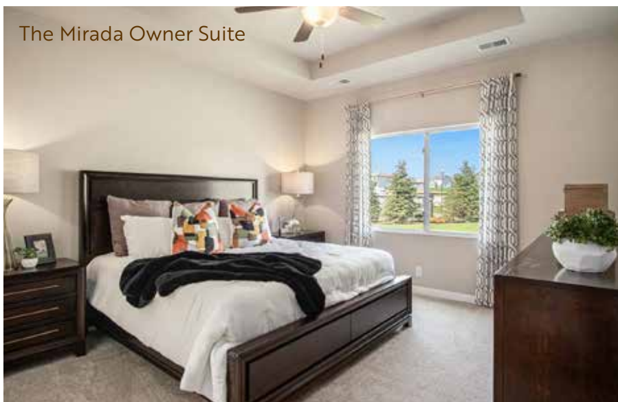
The Mirada Owner Suite