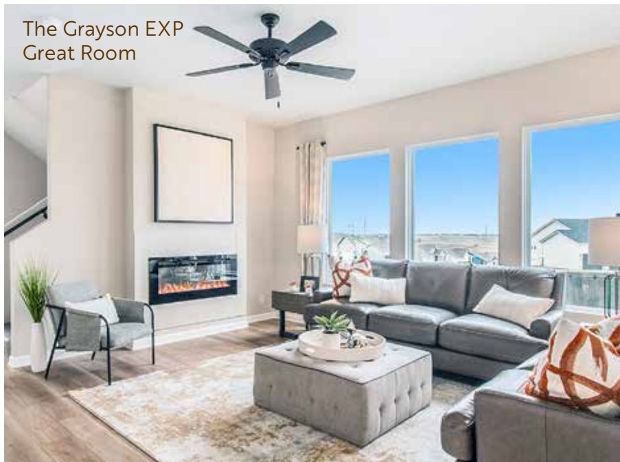
The Grayson EXP Great Room