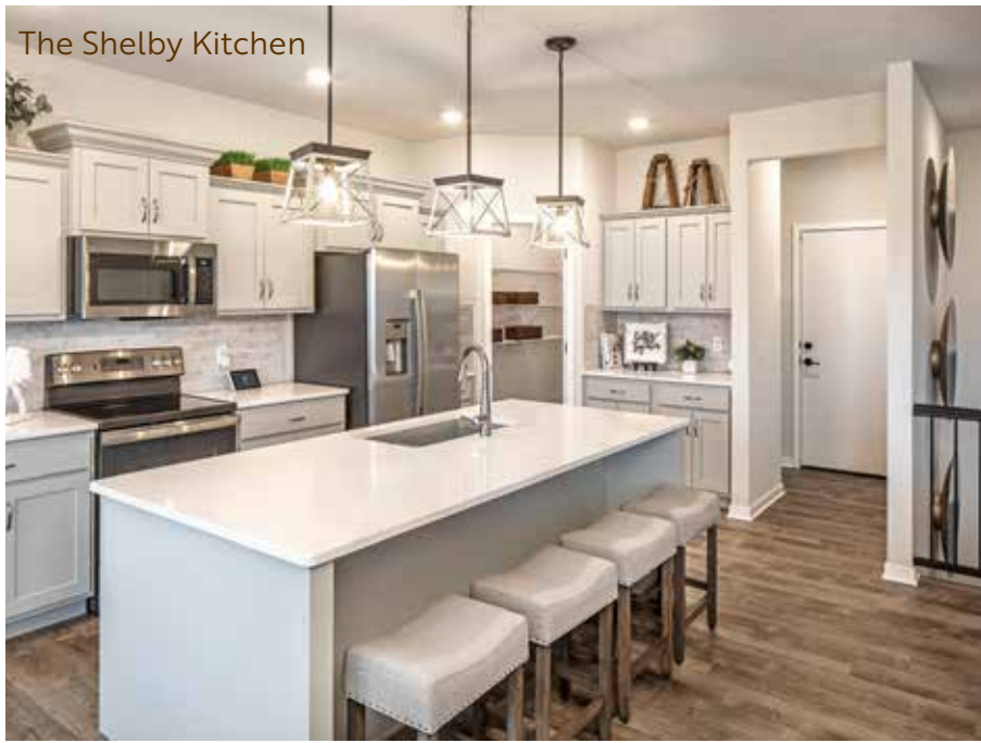
The Shelby Kitchen