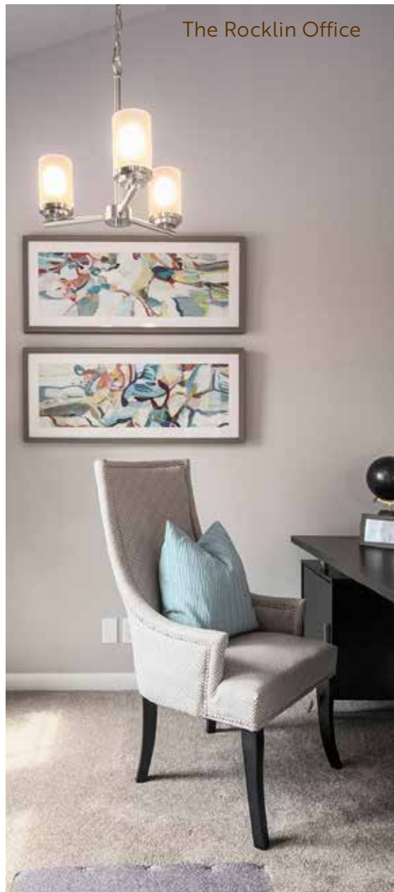
The Rocklin Office