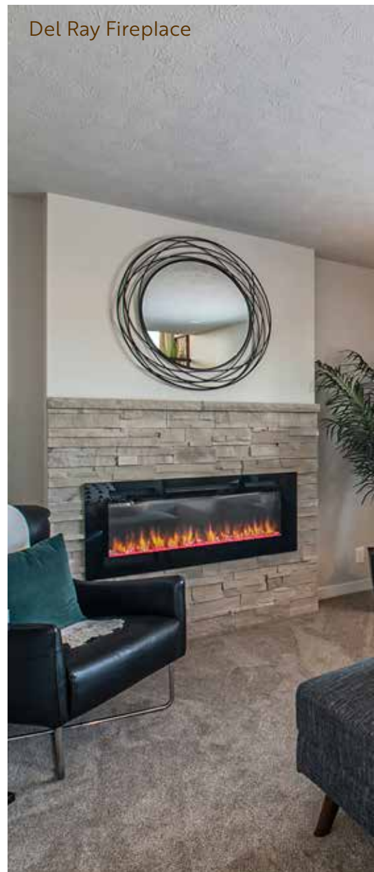
Del Ray Fireplace