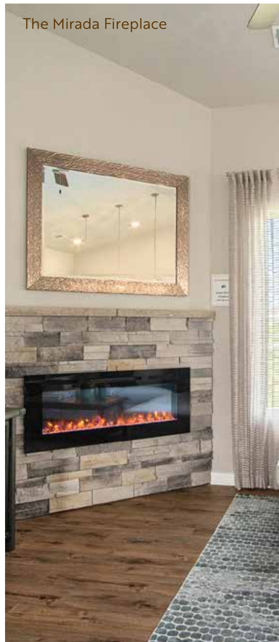
The Mirada Fireplace