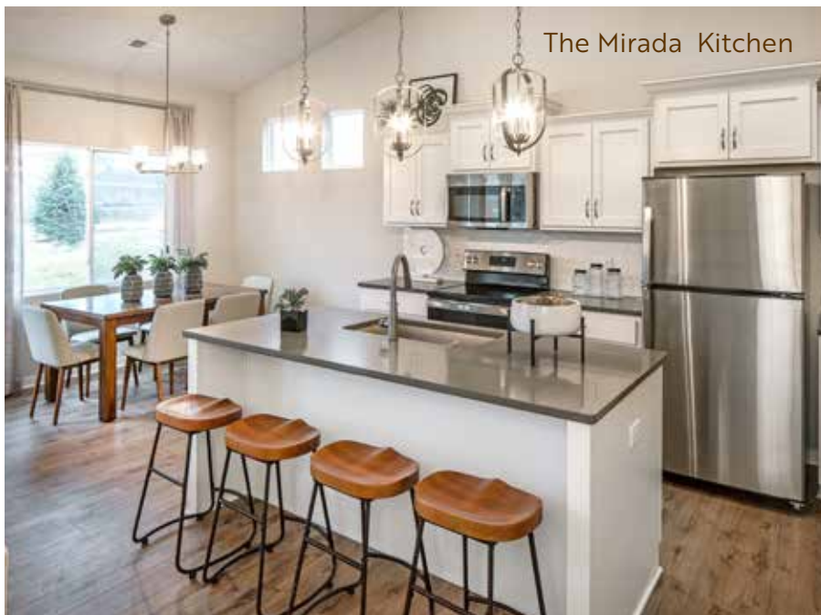
The Mirada Kitchen