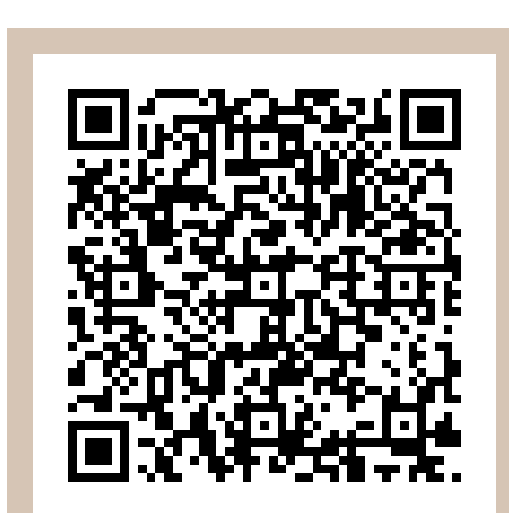
Scan the code above with your mobile device or click it to go directly to the Celebrity Homes website for 8012 N 86 Avenue, Omaha, Ne 68122

Directions: Head North on I-680 to Blair High Rd (hwy 133), head East to Sorensen Pkwy, take Sorensen Pkwy North to Ida. Take a left onto Ida to North 90th Street. Turn Right to the Model Homes in Glenmoor for Community Map and Access to Homes.