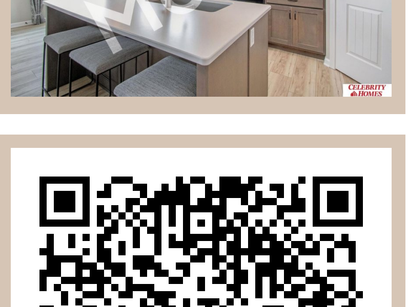
Scan the code above with your mobile device or click it to go directly to the Celebrity Homes & Townhomes website for 8517 S 179 Street, Omaha, Ne 68136