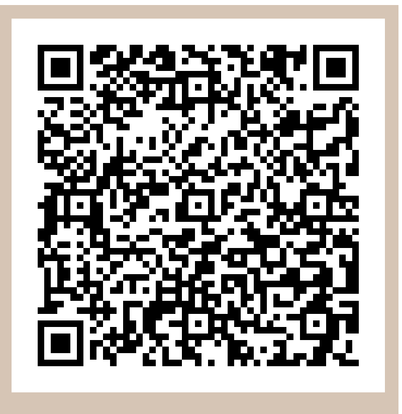
Scan the code above with your mobile device or click it to go directly to the Celebrity Homes & Townhomes website for 8139 S 198 Street, Gretna, Ne 68028

Directions: From 192nd & Giles Rd, head west to 200th Street. Turn right into community. Visit Model Homes in Harrison 210 (210th & Harrison) or Giles Pointe (180th & Giles) for Community Map and access to homes